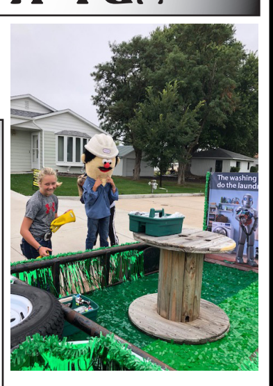
Patriotism the Cowboy Way

We also hope that you had the opportunity to share in the fairs and appreciate the hard work that our local 4-H members and leaders put forth to share with you the traditions that have been a part of this western culture for years.