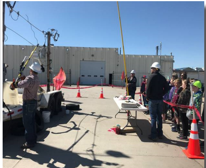
Wheat Belt demonstrates their Power Line Safety To Leyton Students

The presentations are kept short so as to keep the children's attention, and we appreciate the presenters willingness to go through their programs multiple time.