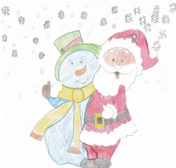
Drawing by Aubrey Campbell

"Tis the Season - Beware of Phone Scammers: Power supply customers have been becoming the preferred scamming target! Remember Wheat Belt will not call you for your credit card information, ask for a "green dot" card payment or bank wire. We do an automated courtesy call to let you know if your service is delinquent as well as the required notice. We expect you to contact us with payment or to go on-line to pay! If you have any questions, please call the office.