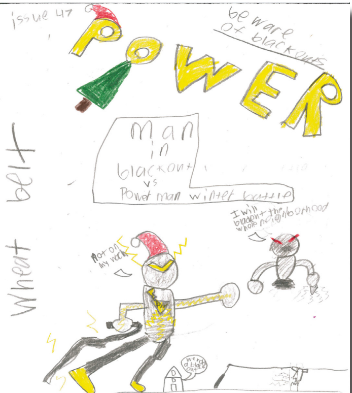
Drawing by Evan Edwards